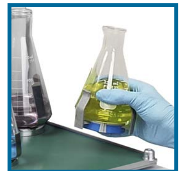
MAGic Clamp Platform H1000-MR with Adjustable MAGIC Clamp (H1000-MR-CMB)